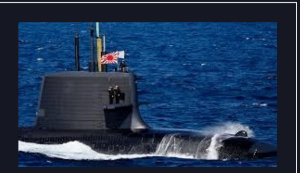
December 24, 2024 – Japan Increases Defense Budget

Farmers across India staged massive protests against new agricultural reform policies, claiming they would benefit large corporations at the expense of small-scale farmers. Demonstrators demanded the government roll back the legislation, accusing it of undermining their livelihoods. The protests reignited debates about economic inequality and rural distress in India.